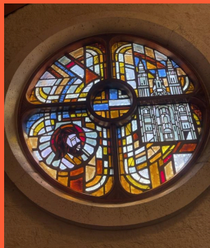
The wood around the stained glass was sanded, stained, and sealed inside and out.