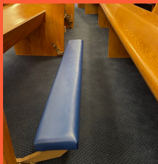
Replacement of carpeting and repair of kneelers